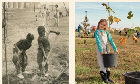
The tree planting that launched Forest ReLeaf was along the Mississippi River and activated thousands of volunteers. 30 years later, volunteers planted the organization's 250,000th tree in the same area along the Mississippi Greenway in north St. Louis.

In 1993, a group of tree lovers formed Forest ReLeaf of Missouri with the goal to provide free trees so that anyone could plant a forest in their community.