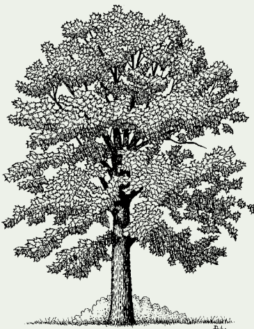
..... HEIGHT #1 (estimated measurement)